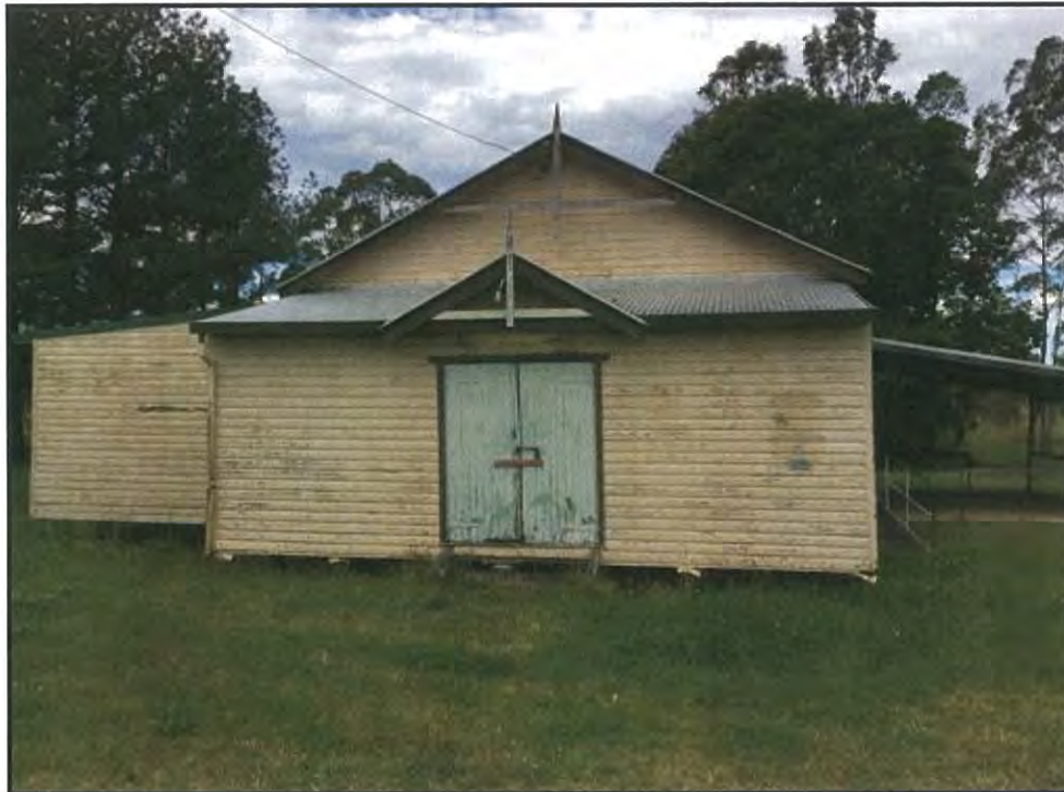
Front Facade of the Hall - October 2015

The existing septic tank and trench for the toilets will be decommissioned separately.