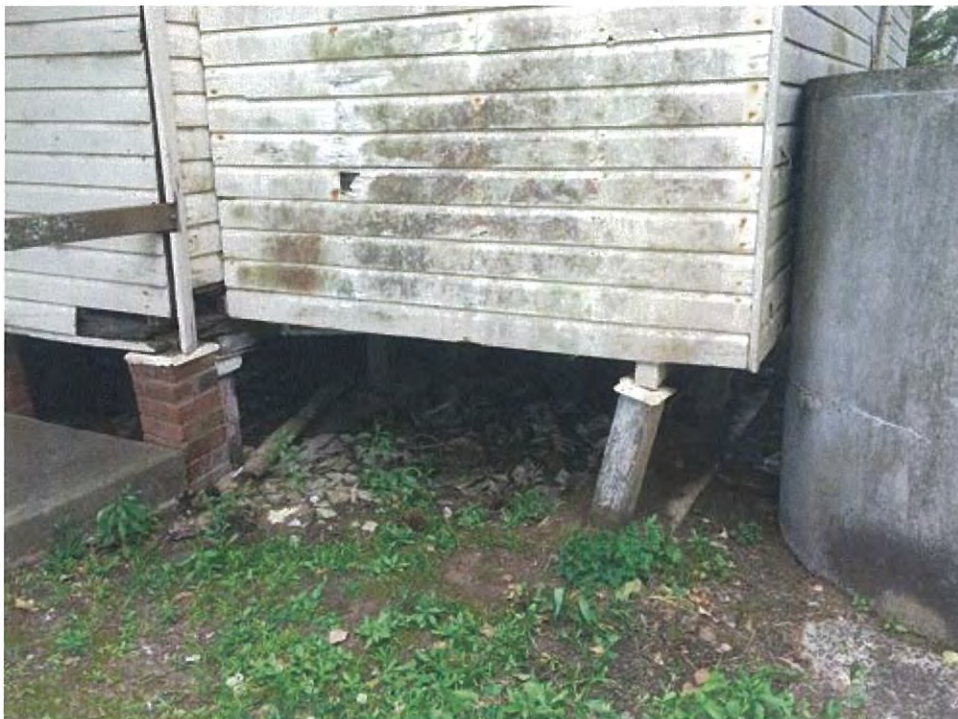
Section of Dilapidated Footings and External Lining