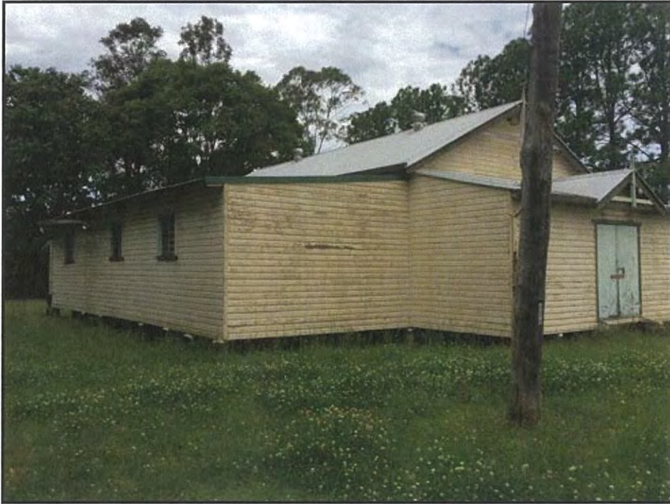
Side View of Hall - October 2015