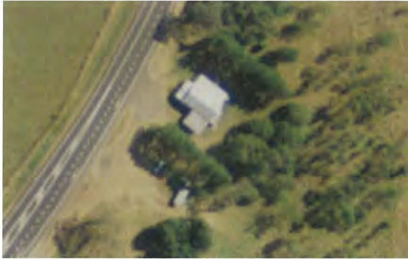
Aerial View of Cedar Point Hall