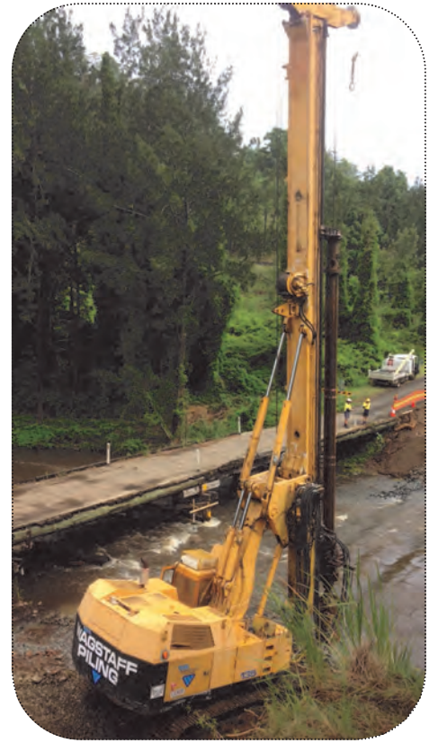
Work progresses on the replacement of Boyles Bridge No 2.

Water and sewer staff will undertake cleaning and CCTV inspection of 20km of sewer mains in the villages of Woodenbong, Bonalbo, and Kyogle along with the re-lining of 1.5km of sewer mains.