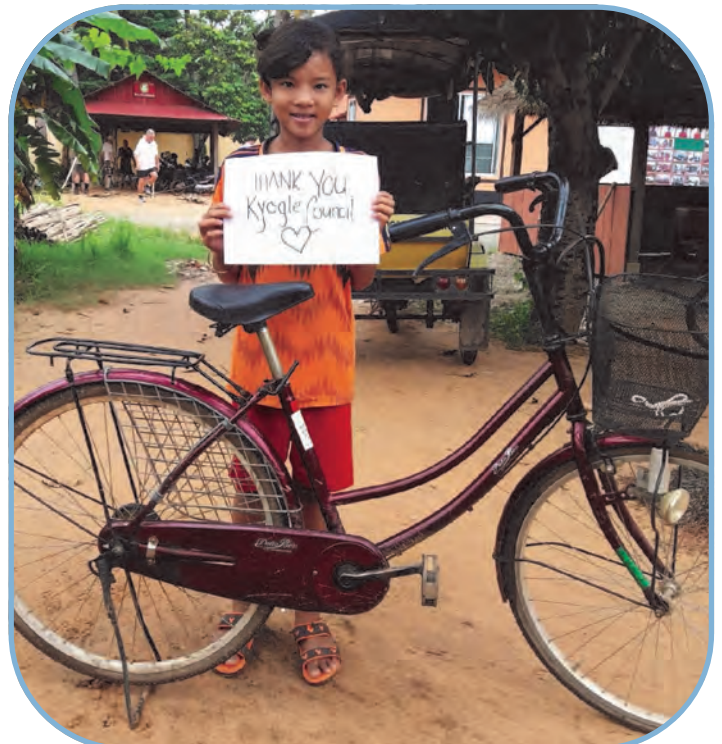
Above: The young recipient of the bicycle sends a message of thanks to Kyogle Council staff.

Feeding Dreams provides education and daily meals for more