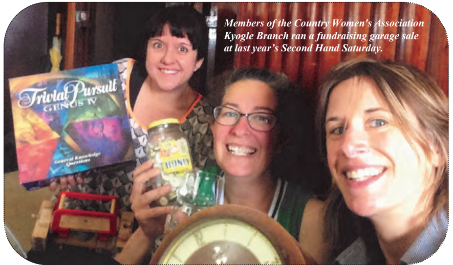
Members of the Country Women's Association Kyogle Branch ran a fundraising garage sale at last year's Second Hand Saturday.

Registrations to hold a garage sale at this event are now open at